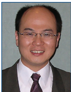
Principal Investigator, Musculoskeletal Biology & Regenerative Medicine Laboratory, Department of Orthopedics and Rehabilitation, University of Wisconsin-Madison

Learn how emerging stem cell-based therapies are providing a biological solution for the treatment of osteoarthritis and are considered advantageous compared to existing pharmacological or surgical approaches.